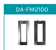
Intercom Flush Mount